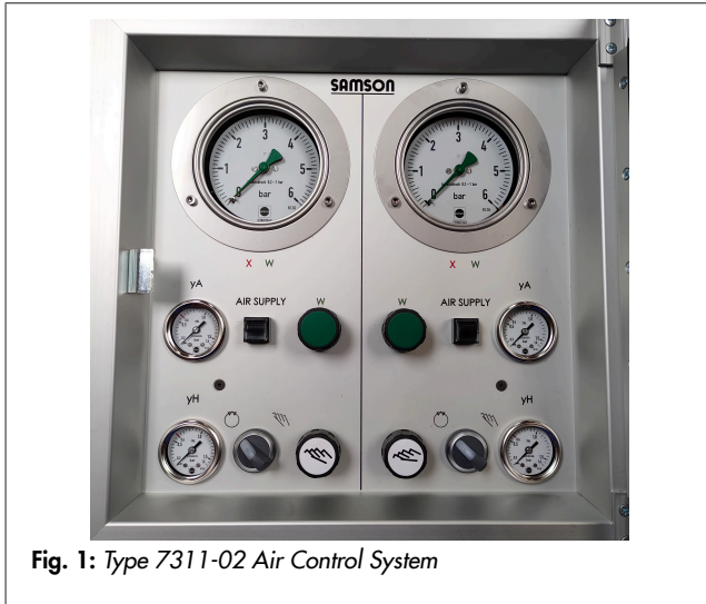
Fig. 1: Type 7311-02 Air Control System

The Type 7311 Air Control System is suitable for use in simple control applications with one or two control loops